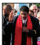
REV. DR. WILLIAM BARBER

Author, New York Times columnist, and CNN commentator