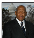
REP. JOHN LEWIS

We will welcome participants across the age spectrum – from elementary youth to those who can remember King's speech in Montreat – to learn, sing, reflect, and worship together. Gather with us to hear leaders from the church as well as from public life. Those challenging us will include: