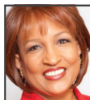
BISHOP VASHTI MCKENZIE

The first woman elected bishop in the African Methodist Episcopal Church